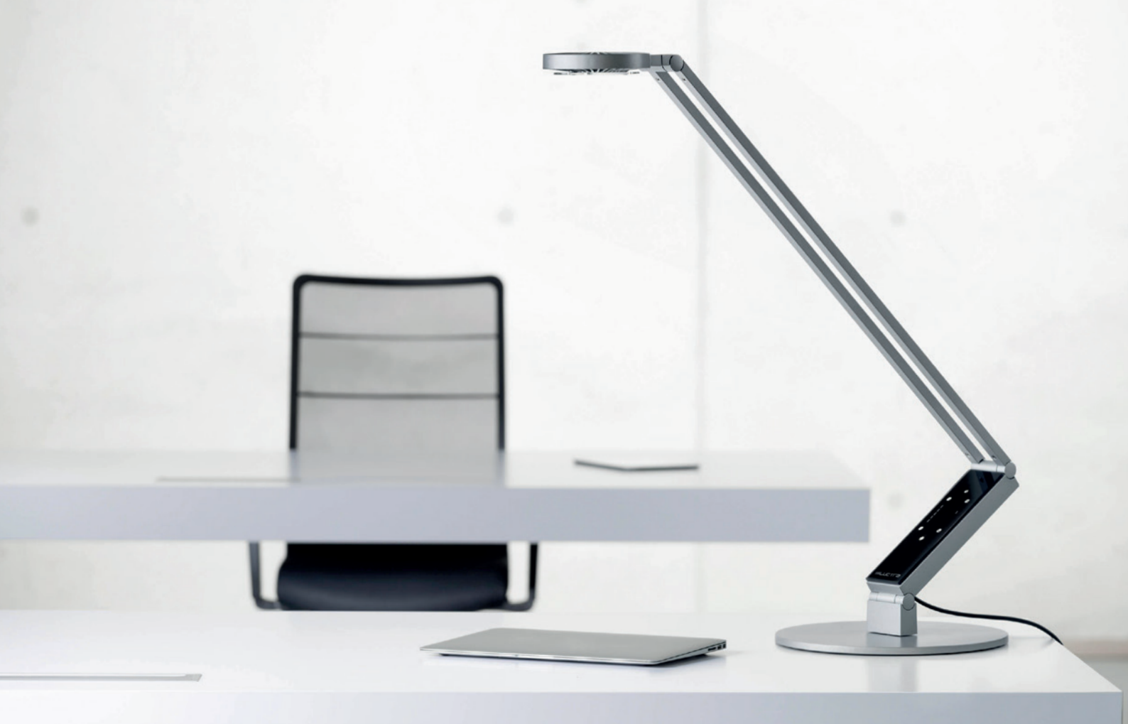
TABLE PRO RADIAL